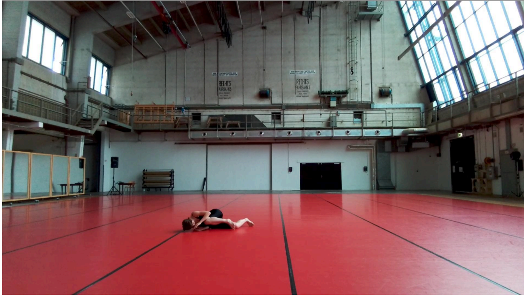
image: screenshot from a recorded improvisation in Studio D at Arsenal